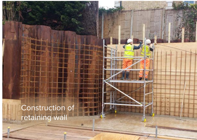
Construction of retaining wall