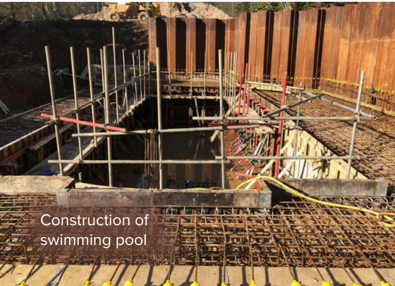
Construction of swimming pool

In other areas, we used a combination of our straight edge and BSU (Brick Support Unit) steel shuttering. This provided our client with the ideal surface to start brickwork, without the need for brickwork underbuild, traditionally seen with Pile and Beam foundations.